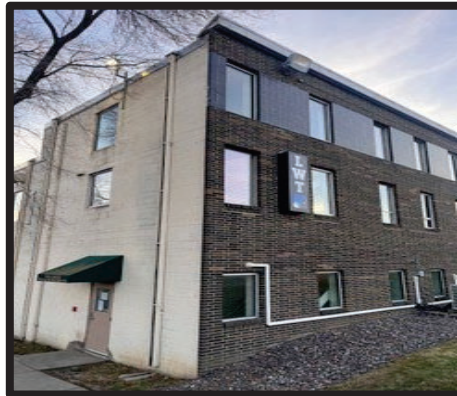
NEW HOPE, MN LOCATION

In 2021, LWT opened the first Minnesota location in Ramsey. This location was moved to New Hope as a branch in 2024.