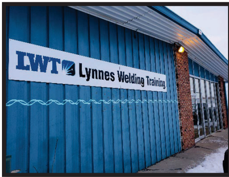
FARGO, ND LOCATION

LWT initially started with 6 training booths and today is operating as the main training location with 27 booths in Fargo, ND.