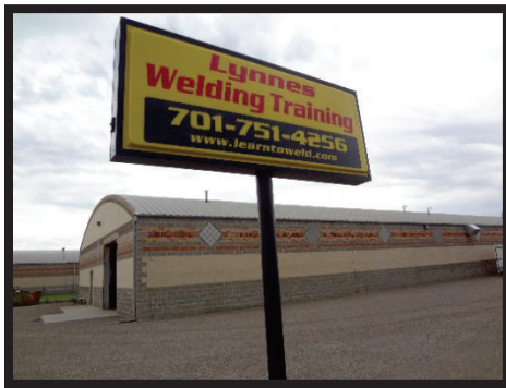
BISMARCK, ND LOCATION

The Bismarck LWT branch initially started with 8 training booths and today is operating with 15 booths.