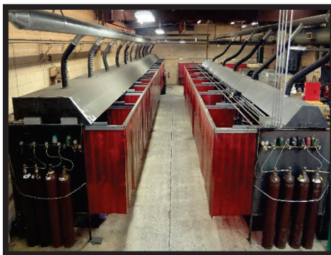
FARGO, ND SHOP

LWT's branch location in Bismarck is a 4,800 square foot building located at 4329 Centurion Drive #9, Bismarck, ND 58504. The facility is equipped with 15 welding booths; multiple grinding stations; plasma cutting equipment; a welding demonstration area; an area for storing materials; an overhead exhaust system; a large classroom; and a reception/office area.