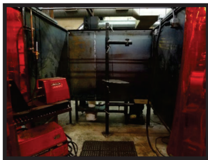
LWT SAMPLE WELDING BOOTH

The welding booths utilized at LWT were custom designed by LWT and are over-sized booths that are metal on three sides with a center post welding station that allows for instruction in multiple welding positions and disciplines. All booths have flameproof curtains and ventilation to exhaust smoke and fumes. Each booth has its own multi-process welding machine, other necessary equipment, and an adjustable table to custom-fit every welder.